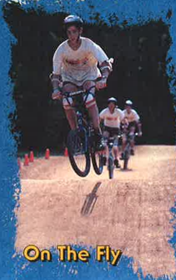
On The Fly